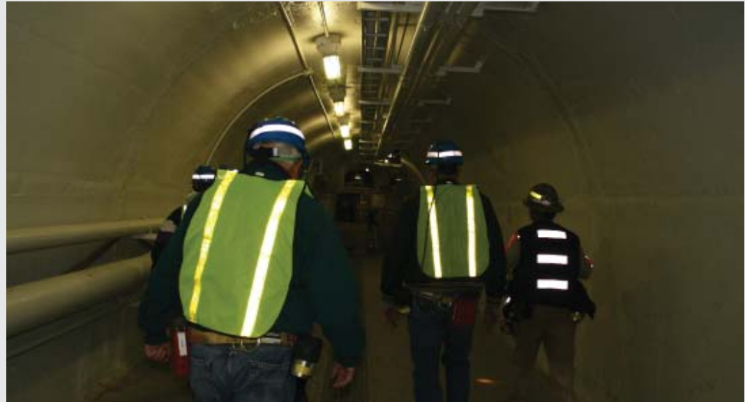
Safety coordinators train all employees in safety procedures. Here miners wear reflective vests and other safety gear in mine tunnel.

The safety coordinator conducts all aspects of safety training, performs workplace inspections, reviews material safety data sheets, and conducts industrial hygiene monitoring. You will maintain personnel records of all employees as well as reports required for State Industrial Insurance, Mine Safety and Health Administration (MSHA), State Mine Inspectors and the company. This job may lead to that of a Safety Manager position. You will need to have a high school diploma, and one year or more experience in mining. You will need to have computer knowledge, to be certified as an MSHA Instructor, be certified as a First Responder, and be willing to continue to the level of Emergency Medical Technician (EMT). A four-year degree in Occupational Health and Safety is preferred. Other helpful knowledge could be gained by becoming an emergency volunteer. Helpful high school courses include Math, Science, English, Chemistry, Psychology, and Computer Science.